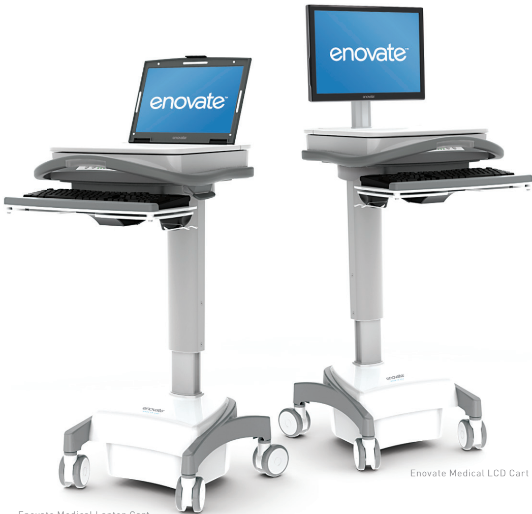
Enovate Medical Laptop Cart