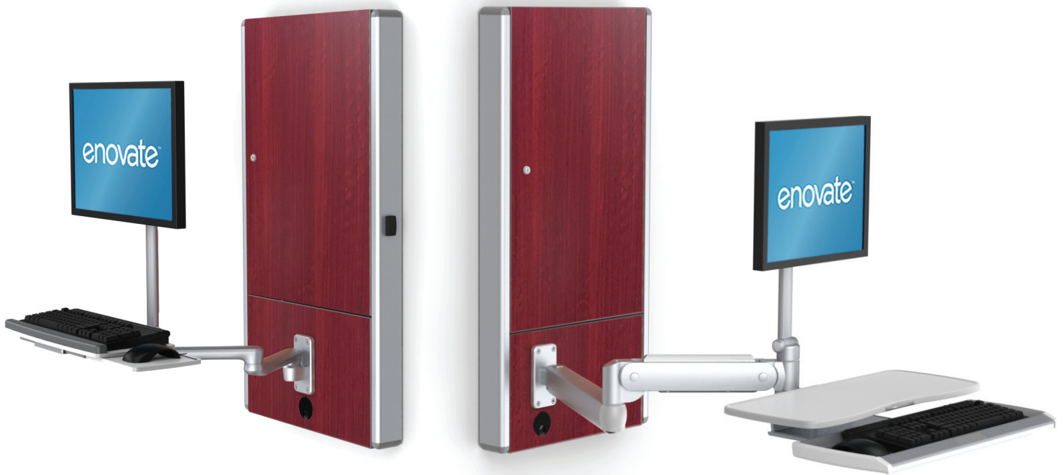
e128 Wallstation, Push-Button Sit-to-Stand Ergonomics

Flexible positioning enables the caregiver to have a full range of motion while maintaining visual contact with their patient. Keeping frequent position changes in mind, the keyboard, monitor, and work surfaces can move together to give the clinician a consistent viewing angle throughout their day.